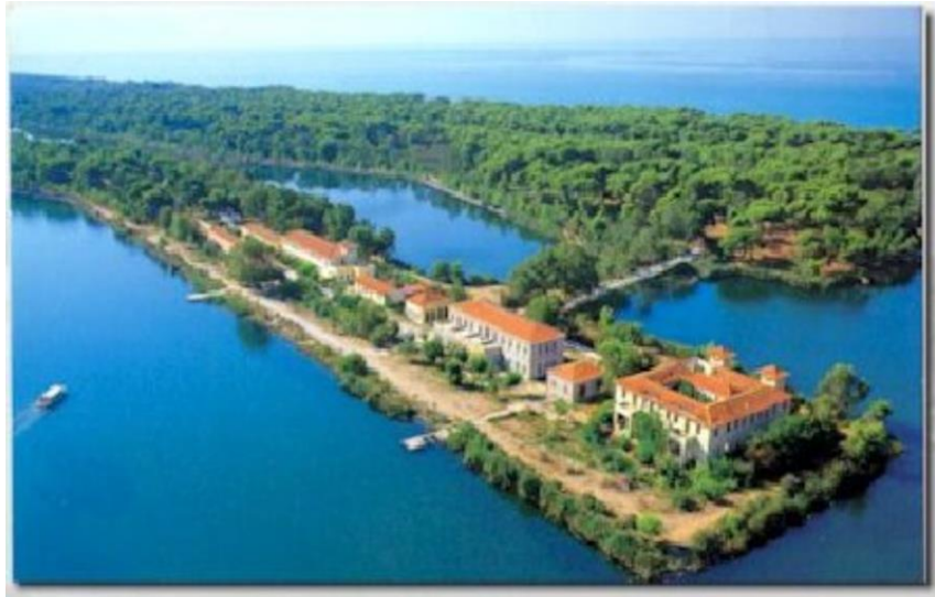
LAKE KAIAFAS, ZACHARO, GR map